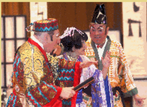
Der Yiddisher Makkado at the University of Miami