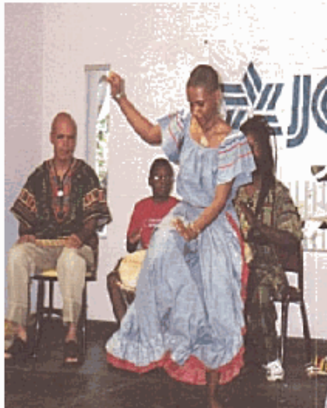
Common Threads performance at Alper JCC