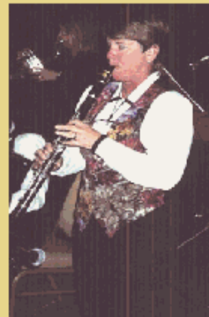
Klezmi-amians perform at Florida International University during the Center's Chagall program